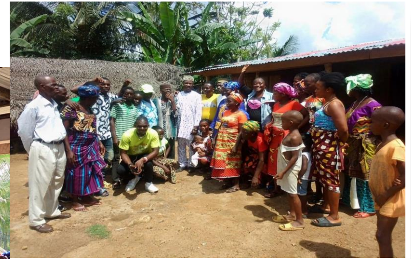
DADUAO TOWN, GRAND BASSA COUNTY