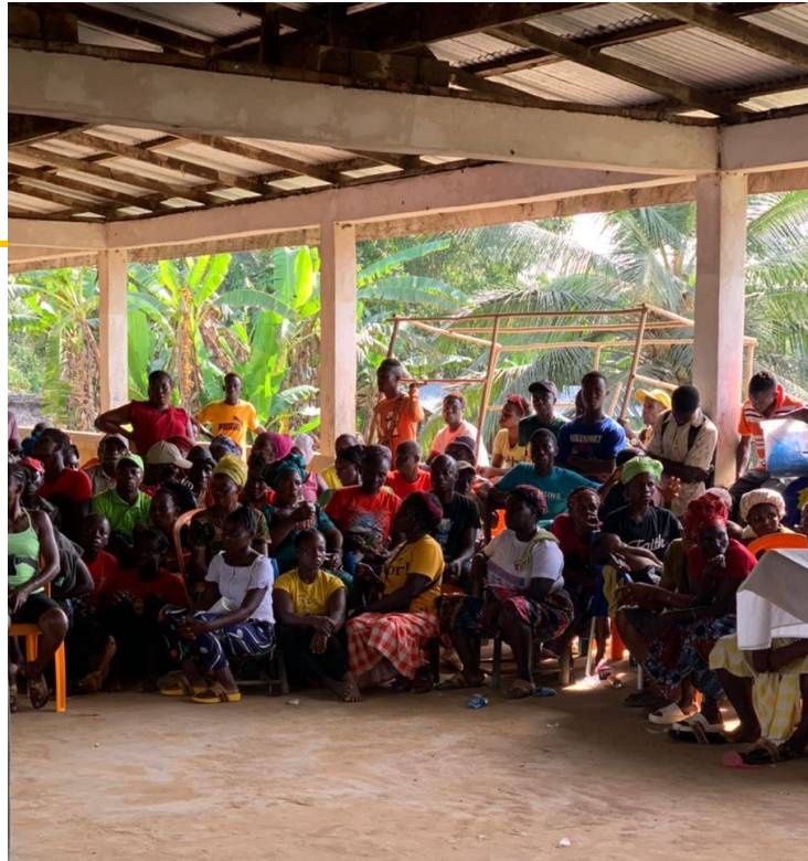
LITTLE LIBERIA, RIVERCESS COUNTY

Agrilink continue to build structures at the local & county levels towards a solid foundation for private investment that would not divert our focus and resources from our core mission, nor create a potential distraction from our strategic goals.