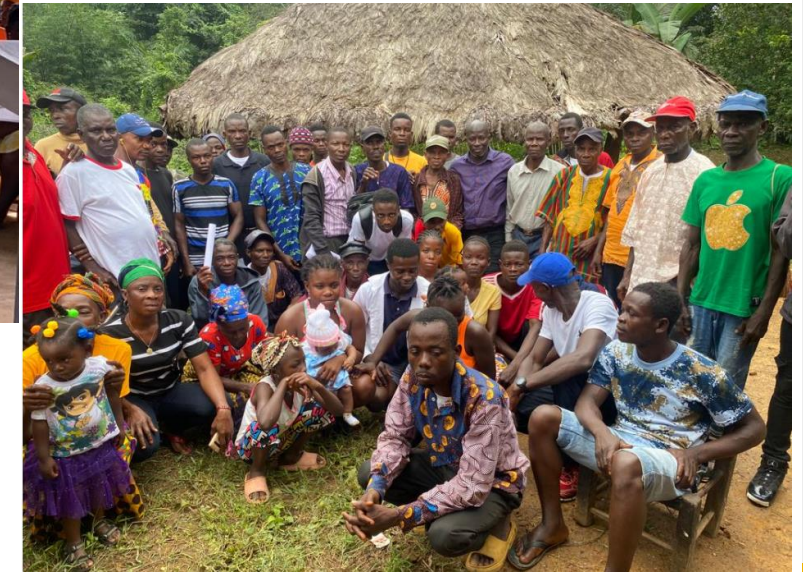
GBORNEE CLAN, GRAND BASSA COUNTY